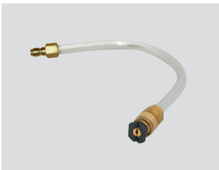
12" gutter cleaning attachment for use with all telescoping poles