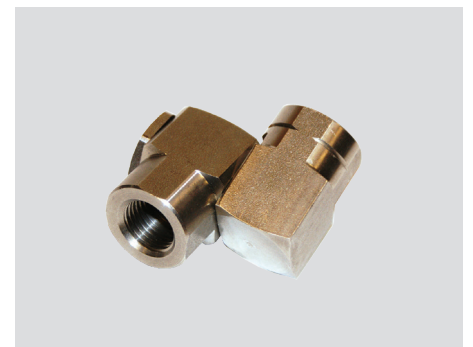
High pressure single swivel with female threads.