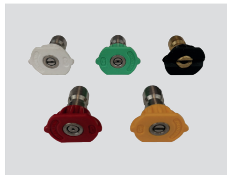
Various degree nozzles, available in singles or packs of 5.