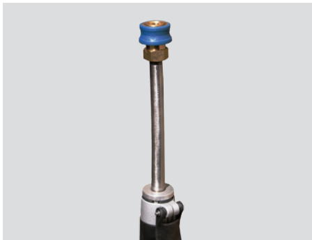
Quick coupler allows selection of nozzles and attachments to be fitted.