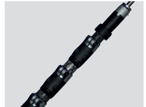
Heavy duty clamps for longevity