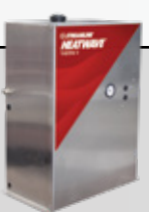
Heatwave™ Thermo 2 Hot Water System Dual Operator THERMO2-D