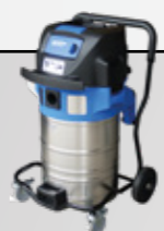
70Ltr Streamvac™ Commercial Height Gutter Cleaning System Complete - 9.1mtr WV-KIT230-10-051