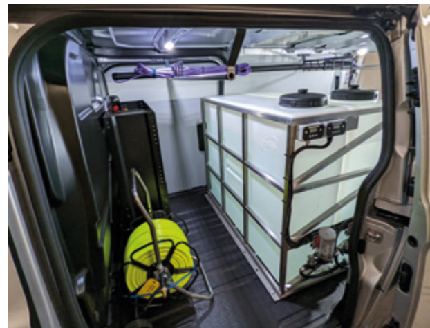
This van build used every inch of the vans floor with space to spare, with a post DI system allowing the pressure washer and window cleaning pumps to operate from the same tank.