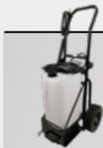
25Ltr Softwash Trolley System SW-T025L-222