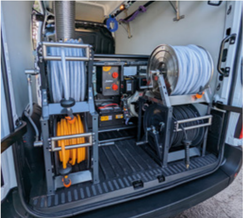
This van was built to very specific requirments from our client combining Soft Washing, High Pressure and Window Cleaning in one.