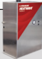
Heatwave™ Thermo 2 Hot Water System Dual Operator THERMO2-D