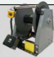
Electric Powerdrive Hose Reel PR16002-AS

W : www.streamline.systems E : sales@streamline.systems T : +44 (0) 1626 830830