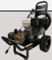
Honda Powered Trolley Mounted Pressure Washer 16lpm 276bar HP-T16276PHR-G